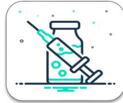
Non Formulary Drug