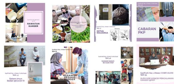
Siri CERITA KAMI