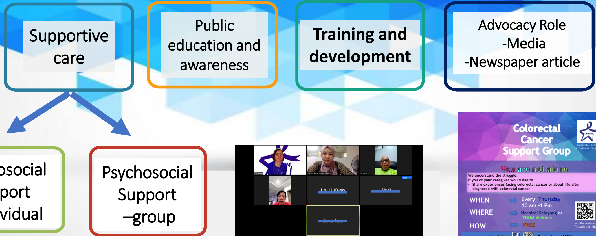
Peer support meeting amidst Covid19 pandemic